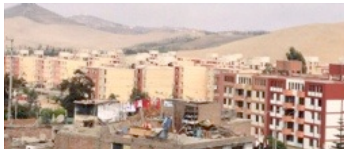
City of Huancayo where our second marriage was held.