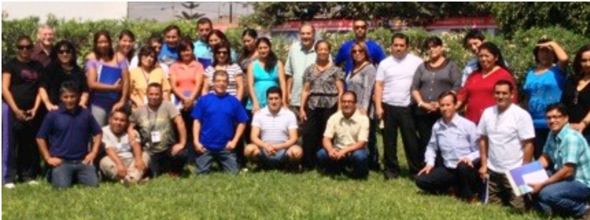
Our first marriage seminar in Lima

The first seminar is already over! Praise God there was very positive response. "Mucho, mucho gracias!" I could even understand one husband looking right at me when stating this signifying the many changes that took place in his life. Many were significantly helped. We found out that the hotel had booked another party so that we could not get the numbers to attend that they originally hoped for. We were glad for a smaller group.