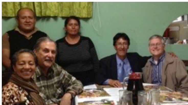
Before feasting on the Guinea Pig