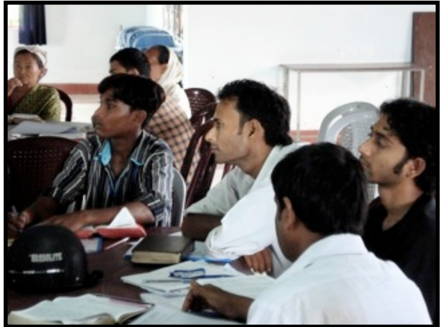
The challenge: Two seminars reaching out to the fledgling Bengali church by equipping their leaders.