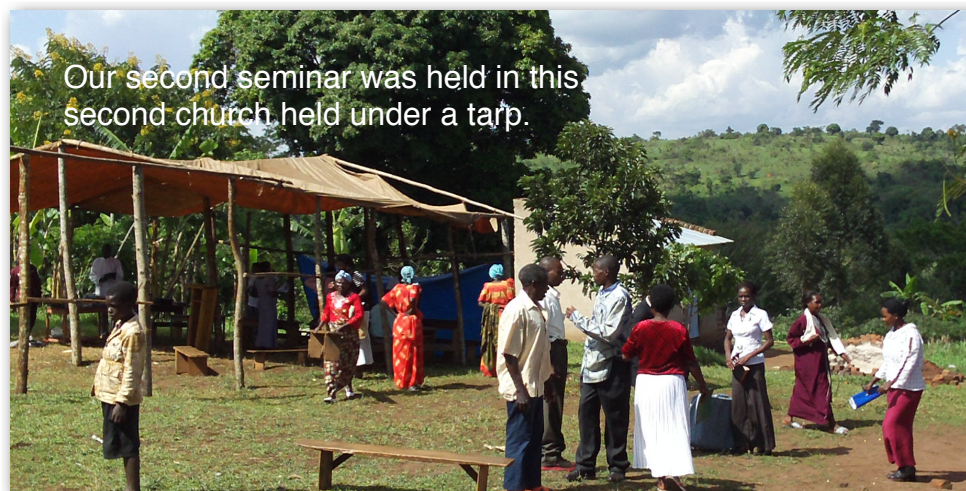
Our second seminar was held in this second church held under a tarp.

We had other difficulties including two huge rainstorms during the late night/early morning hours. The seminar was held outside under a partial canopy (see left). Praise God it didn't happen during the seminar! We also had a truck back into the front door of our car on the way to the seminar