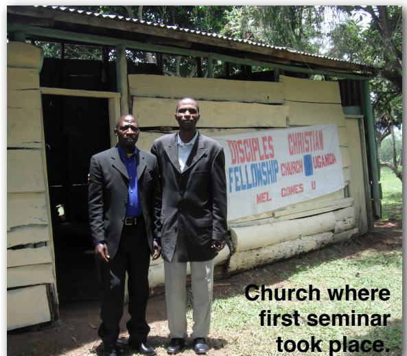
Church where first seminar took place.

This country boasts 80% Christian believers but the